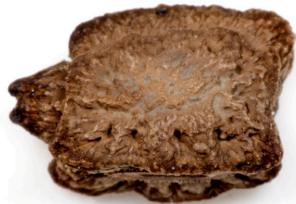
Egg of the Dancing Leaf insect

For more information contact us at info@minibeastwildlife.com.au