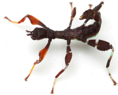
Hatchling of the Dancing Leaf insect